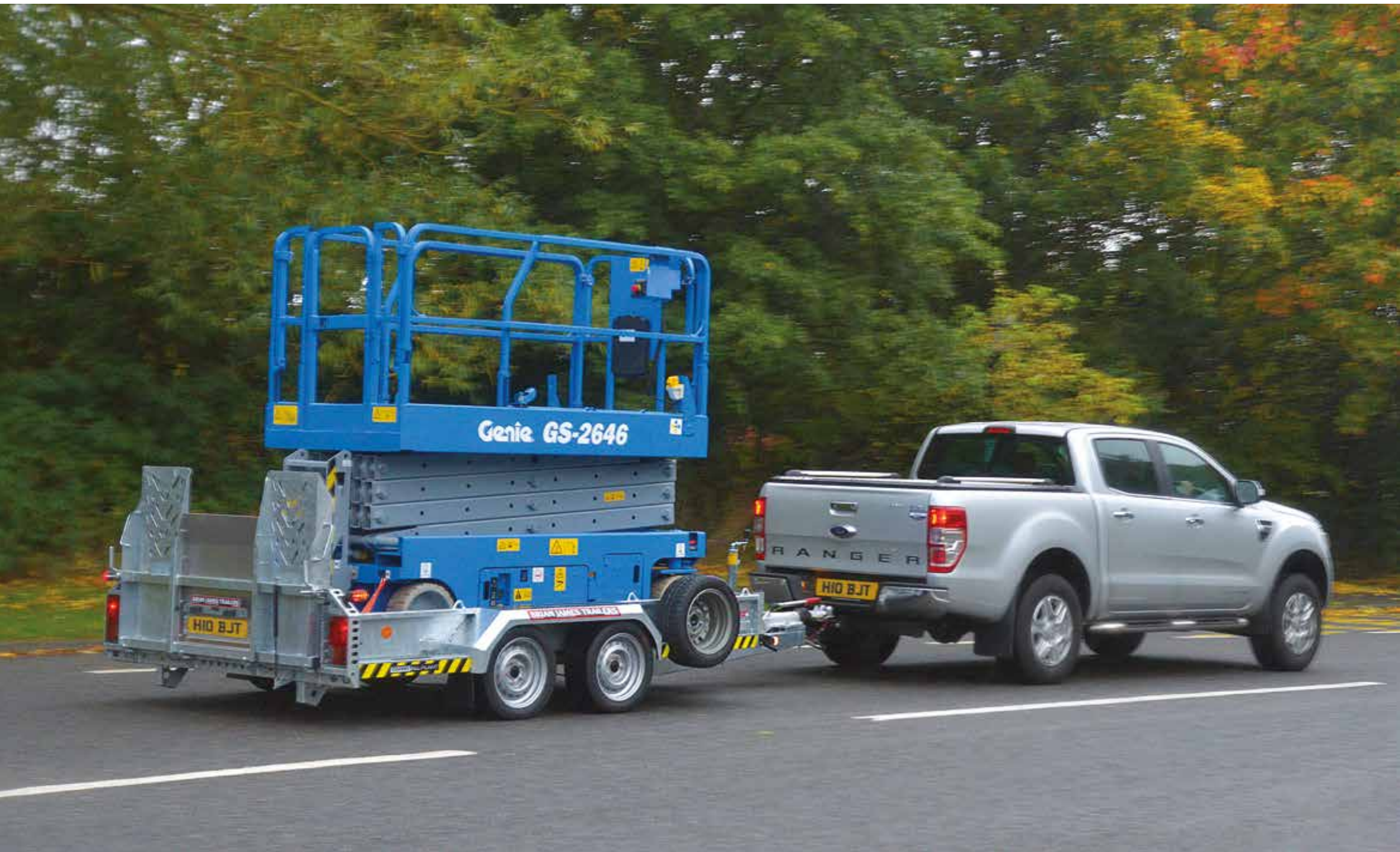
CARGO ALL PLANT TILTBED.