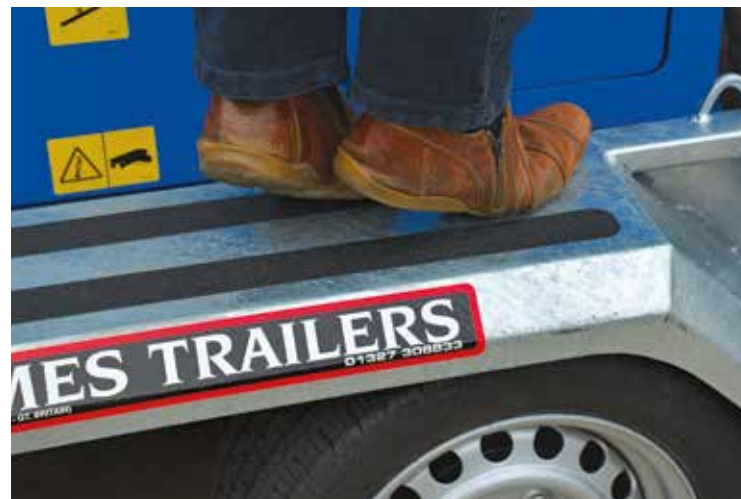
● Mudguards are fully integrated into the chassis for total durability. High grip surface offers operator safety.