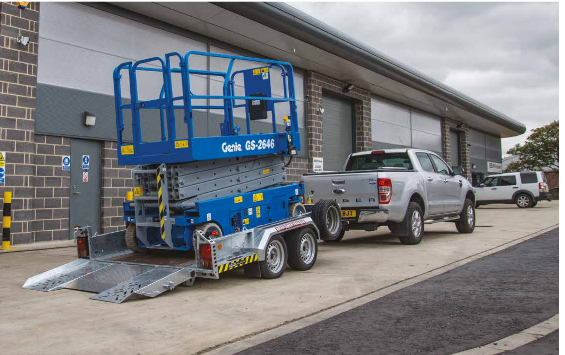
CARGO ALL PLANT TILTBED.