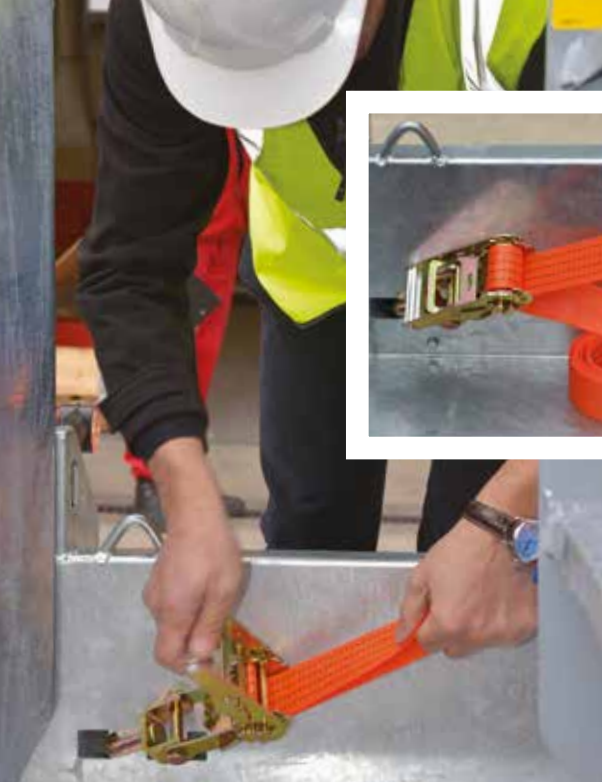
○ Tie-down straps heavy duty, set of 4 for easy and secure fastening of machinery.