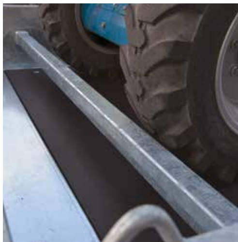
○ Machine stop bar Set up to provide consistent load positioning.