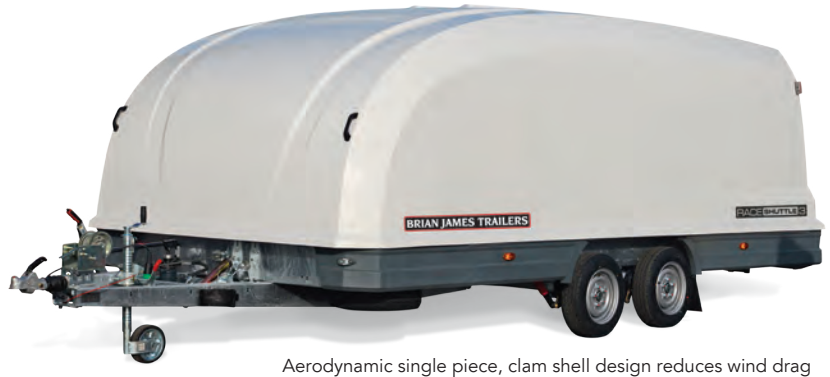
erodynamic single piece, clam shell design reduces wind drag and improves towing fuel consumption.