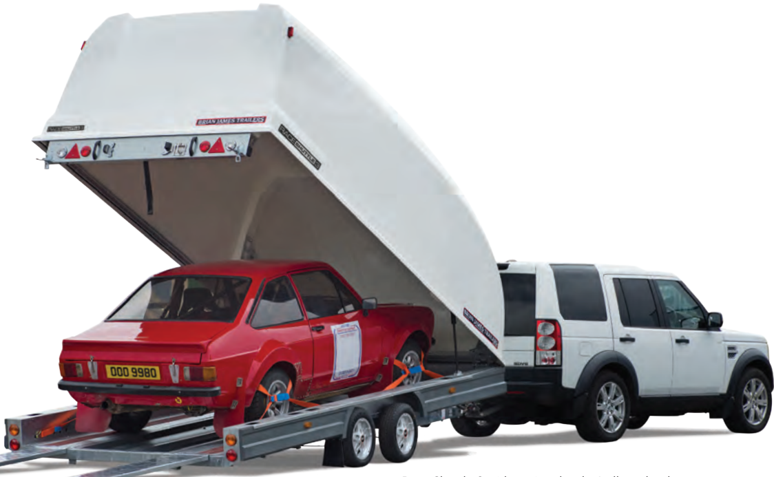
Race Shuttle 3 with optional style 1 alloy wheels.

The range of applications in which the Race Shuttle 3 has proven to be extremely capable extends from the world of rallying, club racing, right through to formula series racing.