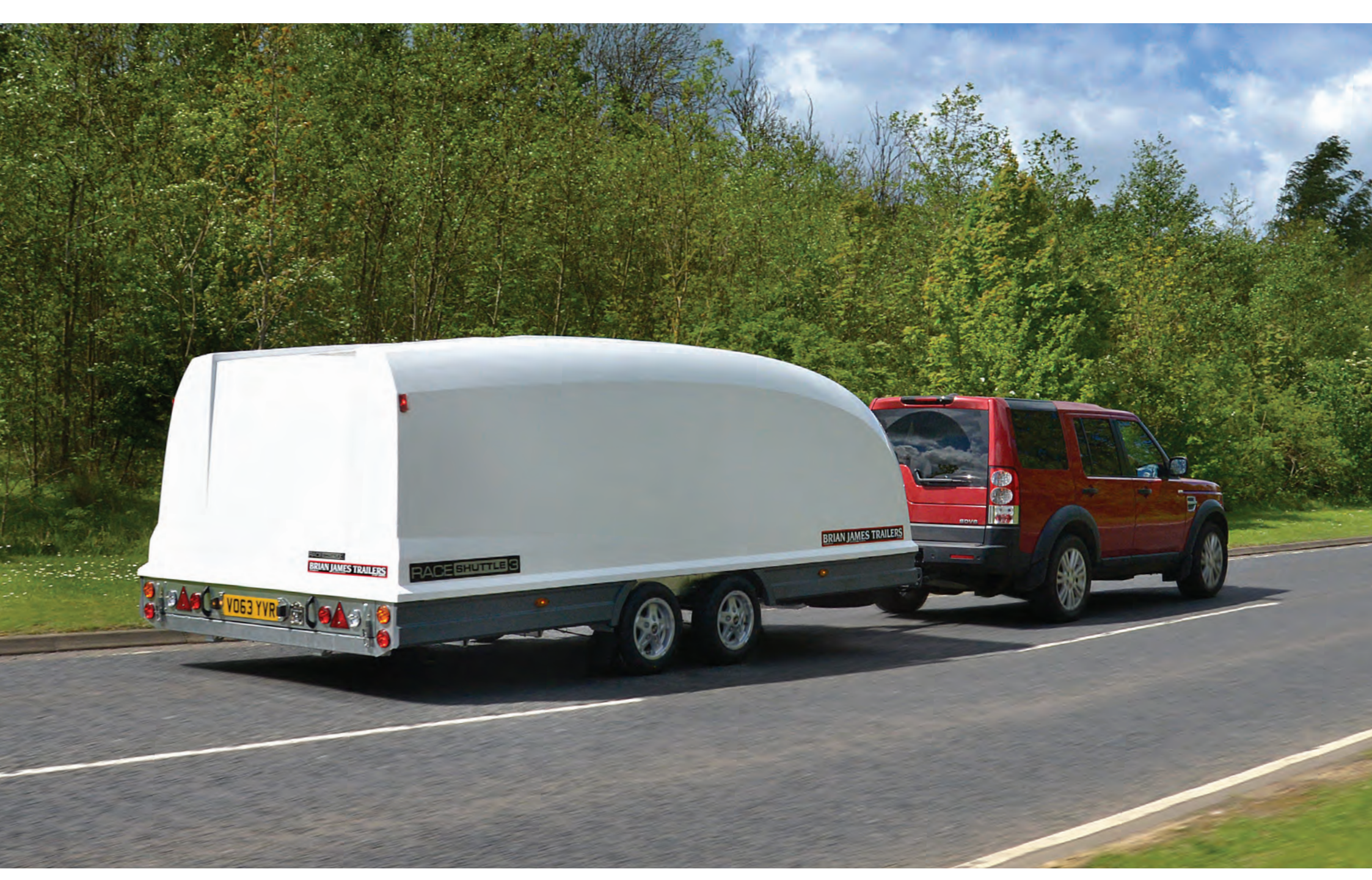
RACE SHUTTLE 3.